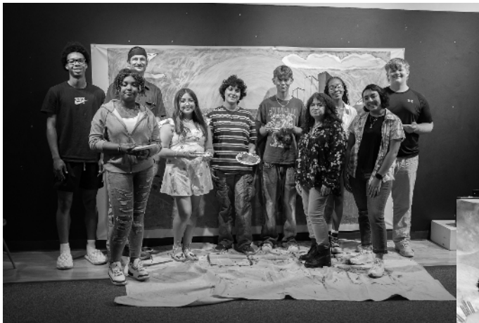
Art Class 2024 Mural Project